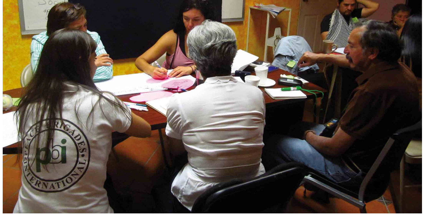
PBI delivering a workshop to HRDs in Ciudad Juárez, Chihuahua