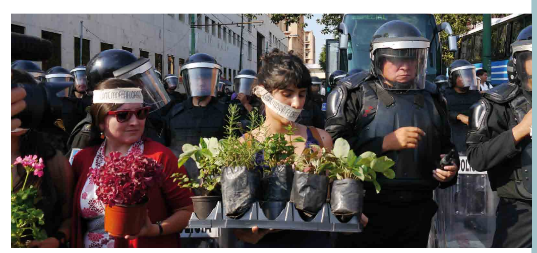
Protest held on October 2 in Mexico City

The year 2013 was marked by strong social protests across Mexico. In the Federal District, an increase in the violent repression of protests was noted, as occurred on October 2 when more than one hundred protesters were detained9. Because of this occurrence, the Inter-American