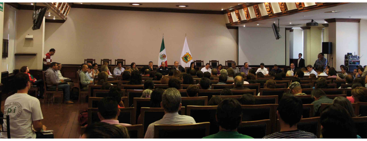
PBI in Saltillo, accompanying the meeting between families of FUUNDEC and government representatives, in which they discussed conducting searches for those who have been forcibly disappeared

With the conclusion of the exploratory mission in 2012, and the decision to open a new field team in the country's north, PBI Mexico focused on beginning accompaniment work in the states of Chihuahua and Coahuila in 2013. Both states have been identified as among the most dangerous for the defense of human rights<sup>21</sup>. PBI has documented attacks, threats, harassment, surveillance, physical aggression, and criminalization against human rights defenders (HRDs) as a result of their work. In only two years, five women activists were murdered in Chihuahua and another 12 left the country because of death threats<sup>22</sup>