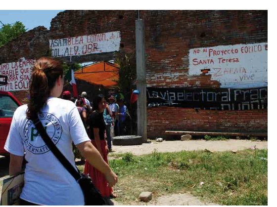
Oaxaca Team volunteer at the Isthmus of Tehuantepec, at the International Megaprojects Seminar on Energy and Indigenous Territory "The Isthmus at the Crossroads"