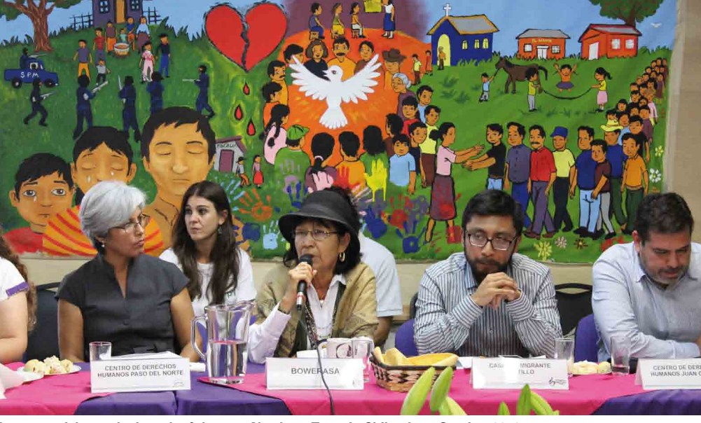
Event to celebrate the launch of the new Northern Team in Chihuahua, October 2013

Local organizations expressed the need for training in political advocacy, and PBI began designing a program of consultations focusing on advocacy and building support networks. This new tool reflects PBI's mandate to share strategies that can empower local civil society actors, and broaden their "space" for action. The program will be stepped up in 2014 to allow more HRDs to benefit.