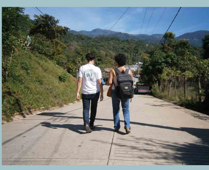
in Oaxaca

In early September, PBI took note vestments. In the United States, Con- these measures were fast tracked. In incided with the Franco-German "Gilberto" a commitment to publicly recognize, via