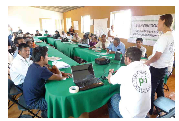
PBI team members giving a security workshop to community human rights defenders in Oaxaca

One important element is that these programs allow PBI to support and endorse a greater number of organizations, even in states where no team is based. In 2013, for example, PBI was able to provide training and strengthening to 43 organizations