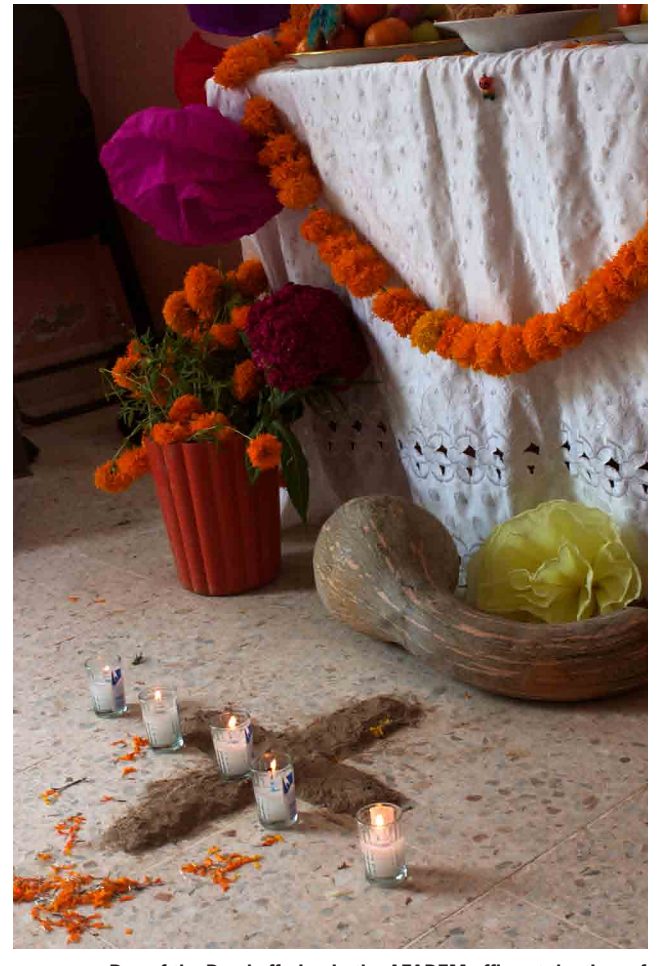
Day of the Dead offering in the AFADEM office at the time of excavations

On the 14th July, the Mexican Supreme Court (SCJN) judges found that the sentence handed down by the Inter-American Court of Human Rights in the Radilla Pacheco case should be enforced<sup>11</sup>. The