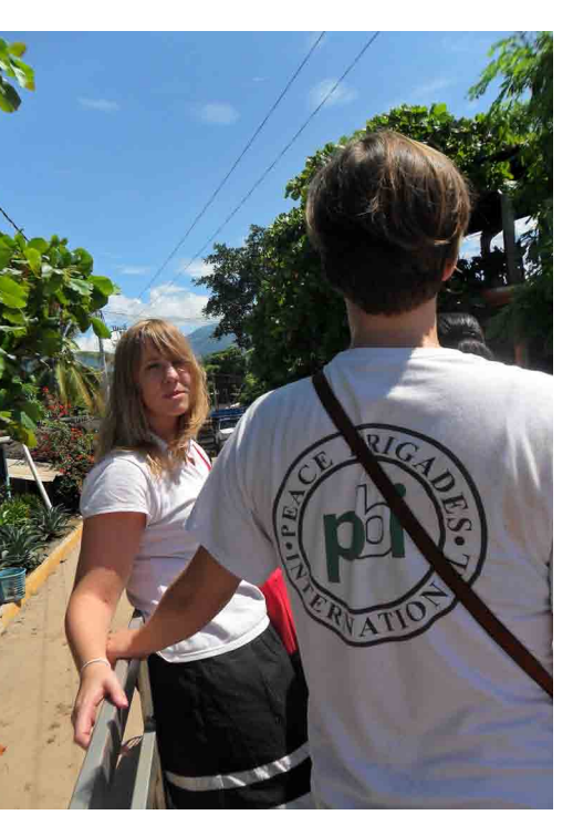
PBI volunteers in Petatlán (Guerrero) during an accompaniment with the OMESP

Basilian Human Development Fund (Canada) Biskaia Lawyers Bar (Spain) British Embassy in Mexico Canadian Embassy in Mexico – Canada Fund Catalan Agency for Development and Cooperation (Spain) Civil Service for Peace (Cooperation and Development Ministry of Germany) Diakonia (Germany) Foreign Affairs Ministry of France French Development Agency (Agence Française de Développement) (France) Fund for Nonviolence (United States) Law Society (United Kingdom) Misereor (Germany) Non Violence XXI (France) Overbrook Foundation (United States) Santander Municipality (Spain) Sigrid Rausing Trust (United Kingdom) Valladolid Municipality (Spain) Valladolid Provincial Council (Spain) Zivik (Germany) PBI Country Groups (Germany, United Kingdom, Belgium, Switzerland, Italy, Canada)