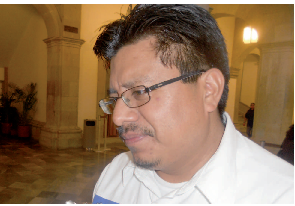
Minister of Indigenous Affairs for Oaxaca, Adelfo Regino Montes, during an interview

Whatever comes in the future will depend on the demands and the response of indigenous peoples. What a Government cannot do is come and divide people, as in other cases. This is a democratic government and it must respect the will of the people. This is our challenge; we have said that we are a democratic government, and now we have to prove it.