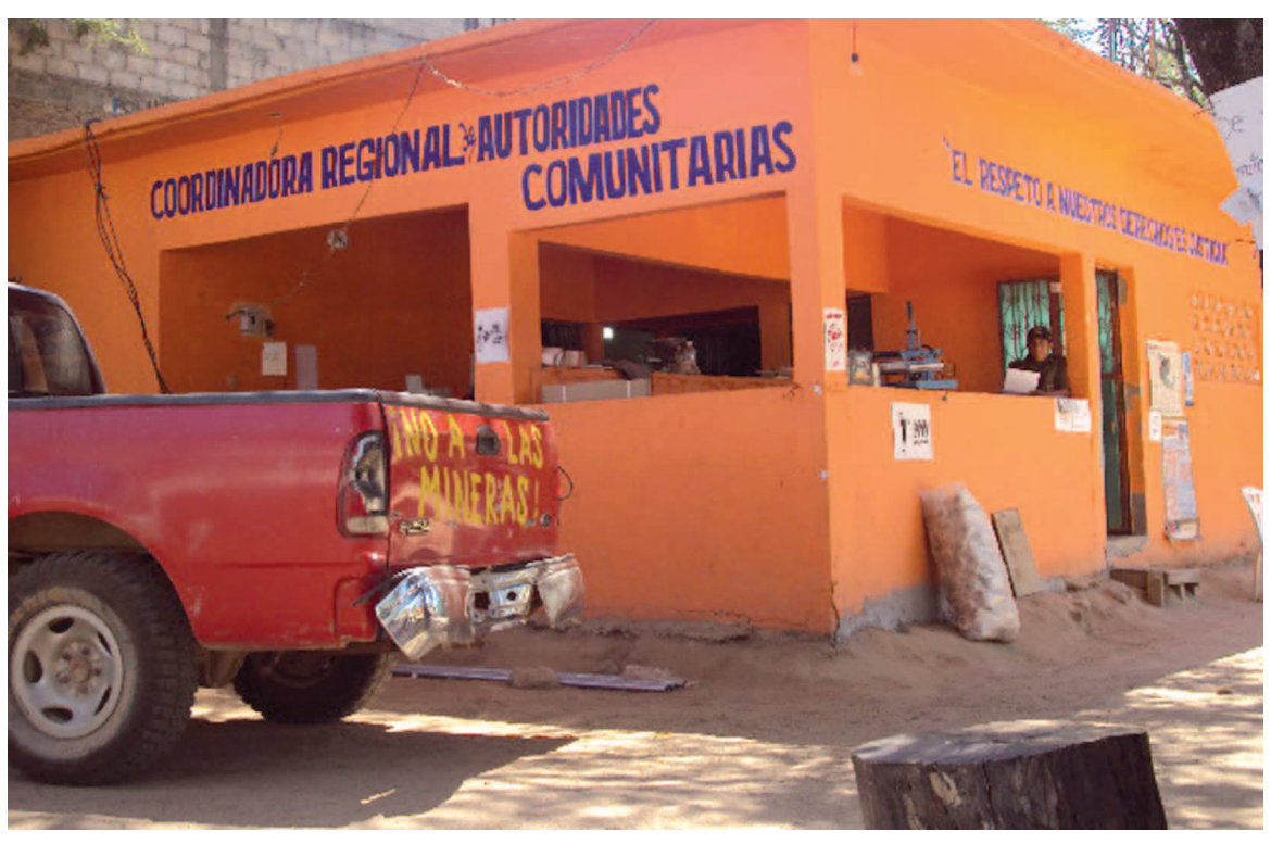
"No mining!" outside the office of the CRAC in Guerrero