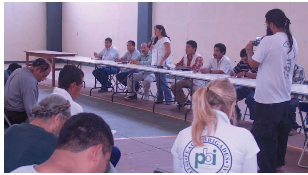
PBI provides accompaniment to staff from Barca-DH during the IV Regional Forum of the Sierra Sur in Zenzontepec, Oaxaca

Barca-DH's work includes workshops about the rights that are affected, including the community's rights as indigenous people, and agricultural rights. "We explain the rights and obligations that they have as communal land owners, and the duties of the [community authorities including] the Commissioner of Communal Property and the Community Assembly. We tell them about the rights they have as indigenous people according to state law, the Constitution, and international treaties and conventions. We want them to know that the people can defend their land rights and can say 'no'."