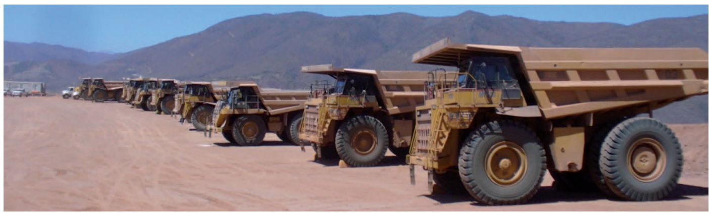
Mining project los Filos-Bermejal in Mezcala, Guerrero

In 2005, the North American company Goldcorp and its Mexican subsidiary LuisMin, obtained a concession to extract gold from an open pit mine in "Los Filos," in the municipality of Eduardo Neri, in the Mezcala region of Guerrero. The conflicts quickly began. The company began to operate in areas in which it had no permission for 'temporary occupation' and the community claimed that it had not been informed or consulted properly. In 2007, the agricultural community of Carrizalillo created the Permanent Assembly of Landowners and Workers of Carrizalillo (Asamblea Permanente de Ejidatarios y Trabajadores de Carrizalillo, APETC), rejecting the mining of the land.