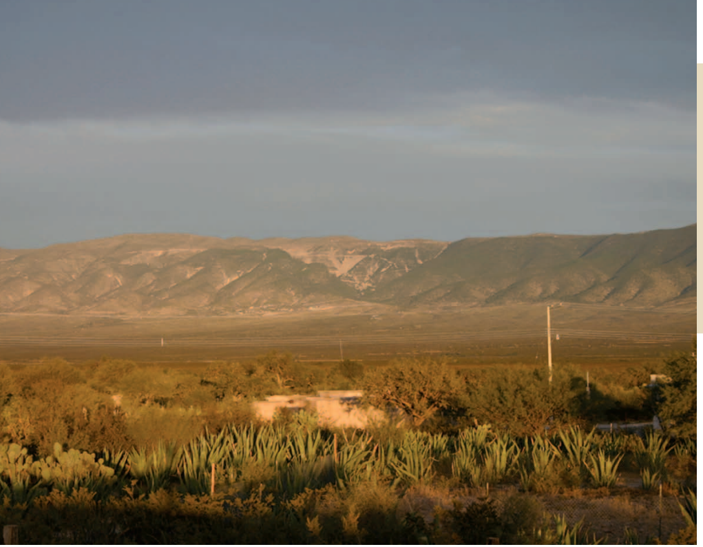
Panoramic view of the Sierra de Real de Catorce in San Luis Potosí

In August 2010, the Santa Catalina community confirmed that there were concessions already granted in Wirikuta and that they faced an imminent mining threat. AJAGI accompanied the first on site inspection requested by the indigenous community of Santa Catalina and performed an analysis of the environmental and social impact that would be caused by the mining operations by First Majestic. According to information provided by the