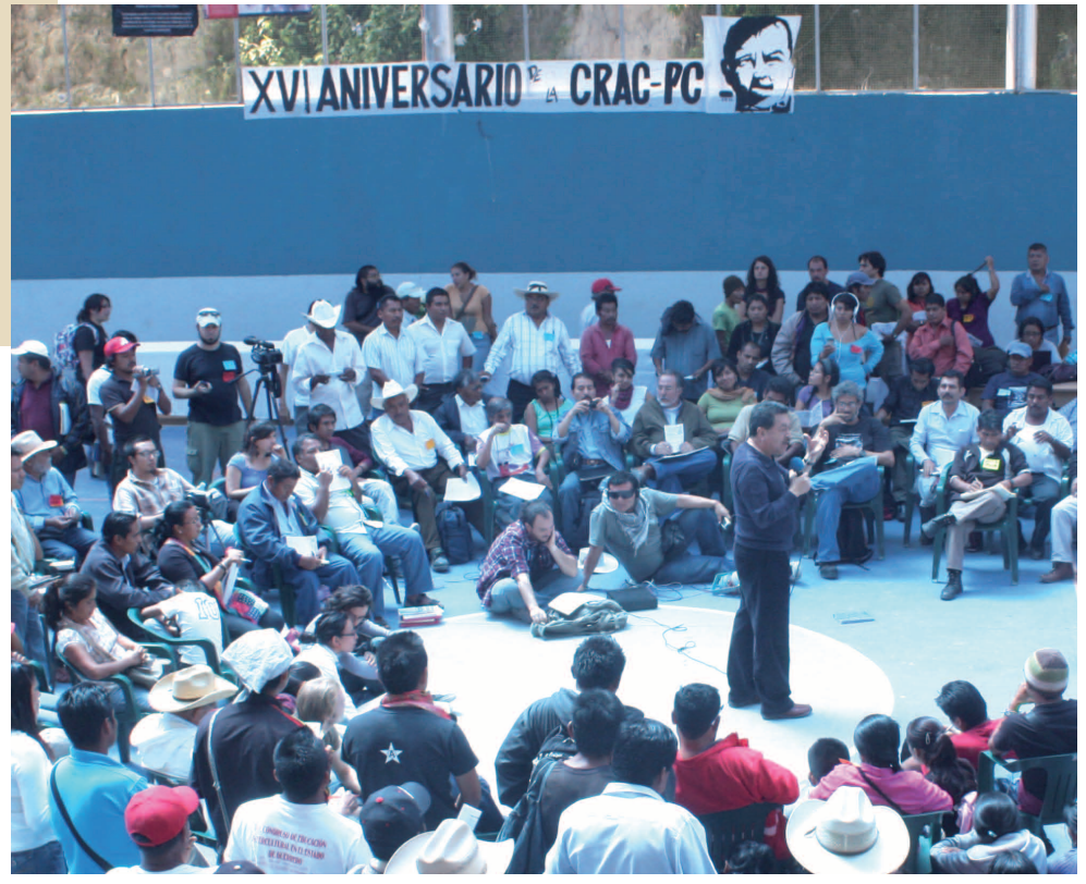
Discussion group during the CRAC's XVI anniversary

Private companies are given permission to enter a region with the support of the federal, state, and municipal governments. In the municipality of San Luis Acatlán there are 7 or 8 concessions.