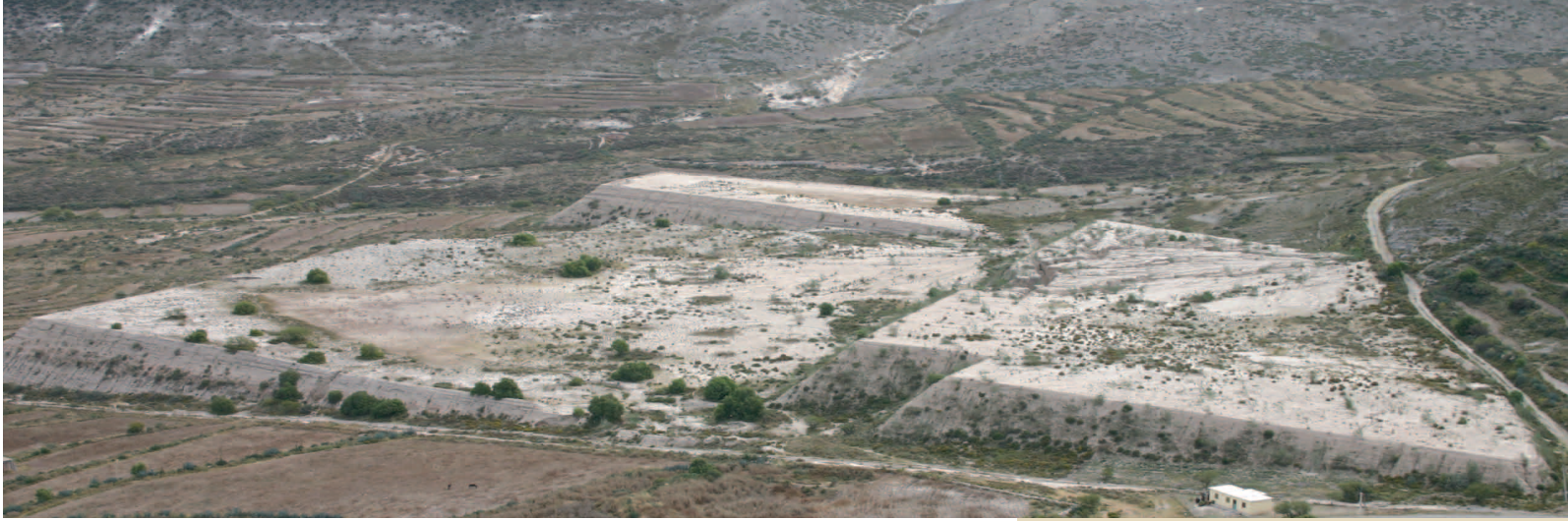
Land deposits in El Potrero, Real de Catorce

dams." The tailings dams contain residue of toxic waste material that accumulates over the years, and contain extremely dangerous heavy metals such as lead, antimony, or arsenic. Tunuary says that "the official norms and scientific research indicate that healthy limit of antimony is 9 parts per million before it begins to cause damage to a living organism. In a sample of sludge collected in the area of Real de Catorce and analyzed in a laboratory at the University of Guadalajara, we found 54