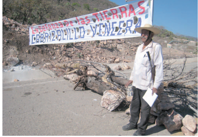
Farmer from Carrizalillo protests against mining

In our experience, we have found that one of the best ways to protect economic, social, and cultural rights and to fight for a life with dignity, does not come from the individual, but instead through solidarity and collective organizing.