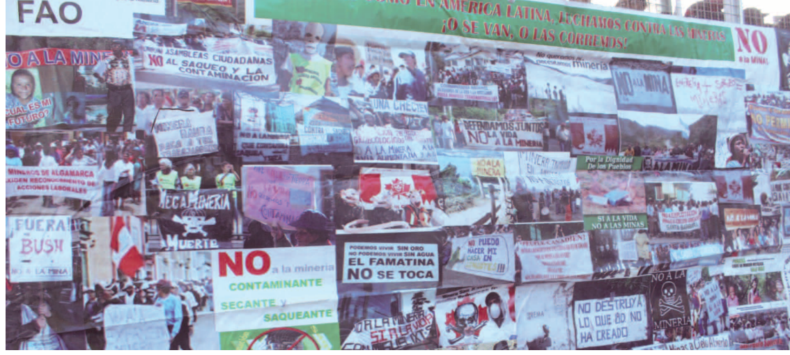
Signs against mining operations

siders that the international community's responsibility is undeniable. "If gold prices go up in the international stock exchanges, more mining companies come to Mexico and destroy us. Everyone buys gold now to secure their savings these days, or for ornaments, or as a gift. The international community must understand what extraction means; it should know that what is being purchased destroys places where people live and the lives of others. They are buying gold with blood."