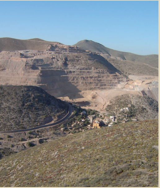
View of the Mine in Cerro San Pedro, San Luís Potosí